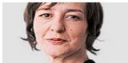
Victoria Coren Mitchell